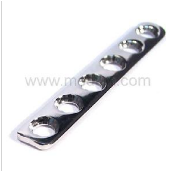
2.00 mm Miniplate