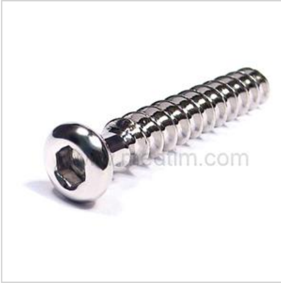
Fully Threaded 3.5 mm Cancellous Screw