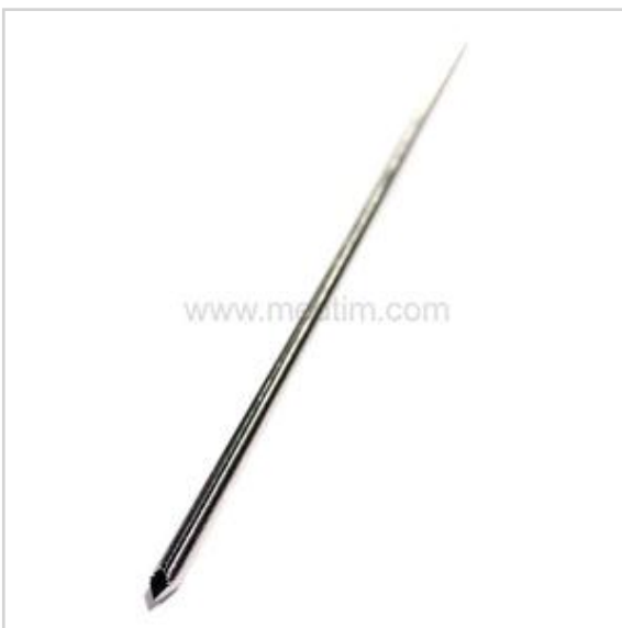
Threaded Steinmann Pin