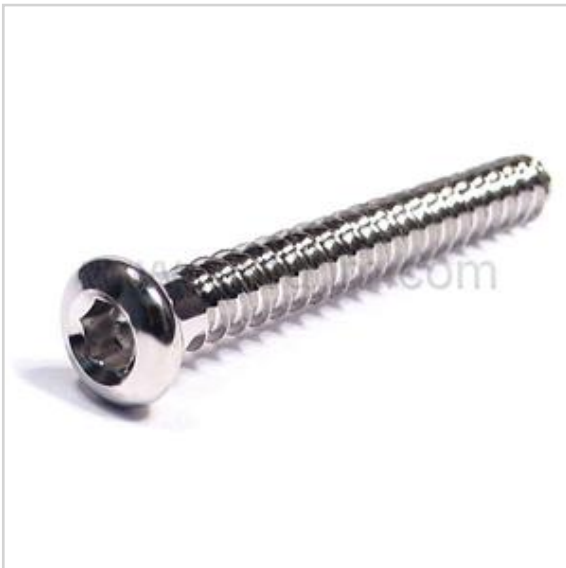
3.5 mm Cortical Screw with 1.25 mm Pitch