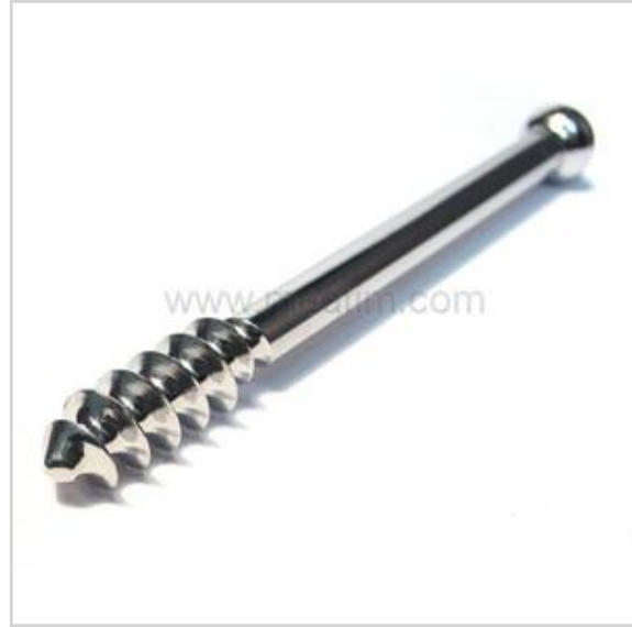
Threaded 6.5 mm Cancellous Screw (16 mm)