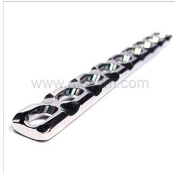
3.5 mm Small-Fragment Limited-Contact Dynamic-Compression Plate (LCDCP)