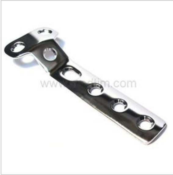
4.5 mm T-Shaped Locking Compression Plate