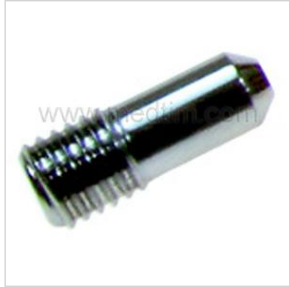
Stabilization Screw for Tibial Intramedullary Rods