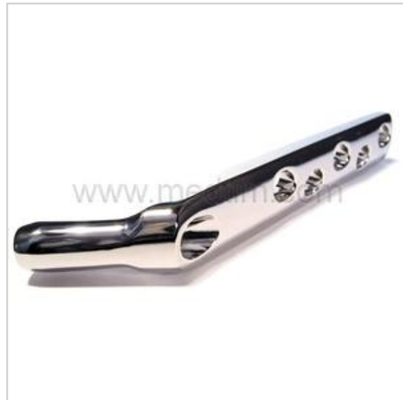
Dynamic Hip Screw (DHS) Plate 135°