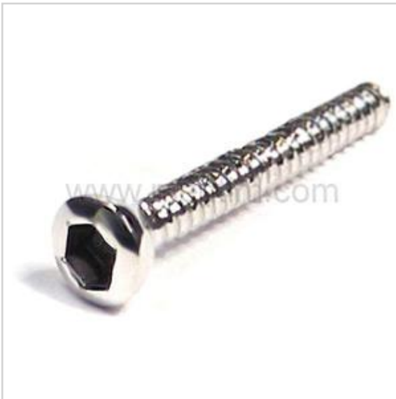
1.5 mm Cortical Screw