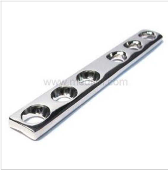
4.5 mm Narrow Dynamic-Compression Plate