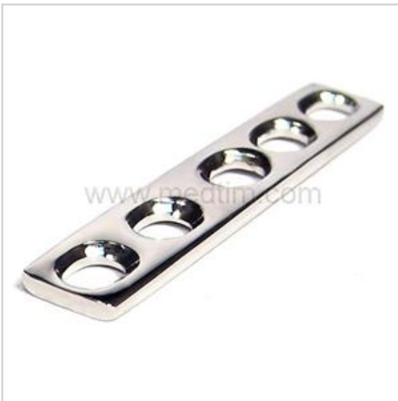
2.0 mm Straight Dynamic-Compression Plate (DCP)