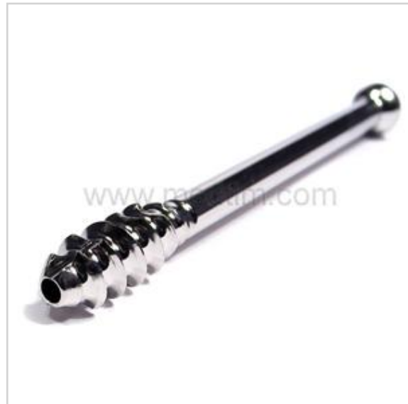
16 mm Thread 7.0 mm Cannulated Screw