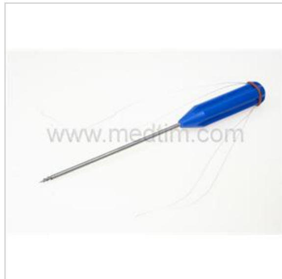
Polyester Anchor Screw