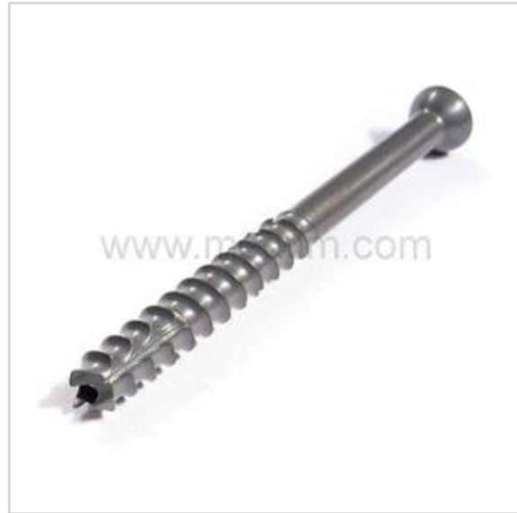
Partially Threaded 4.5 mm Titanium Cannulated