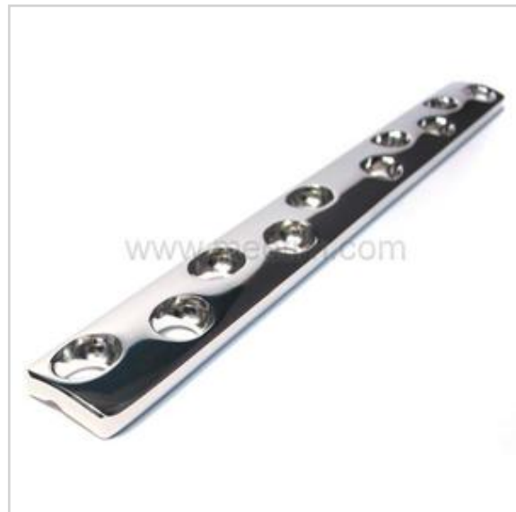
4.5 mm Broad Dynamic-Compression Plate