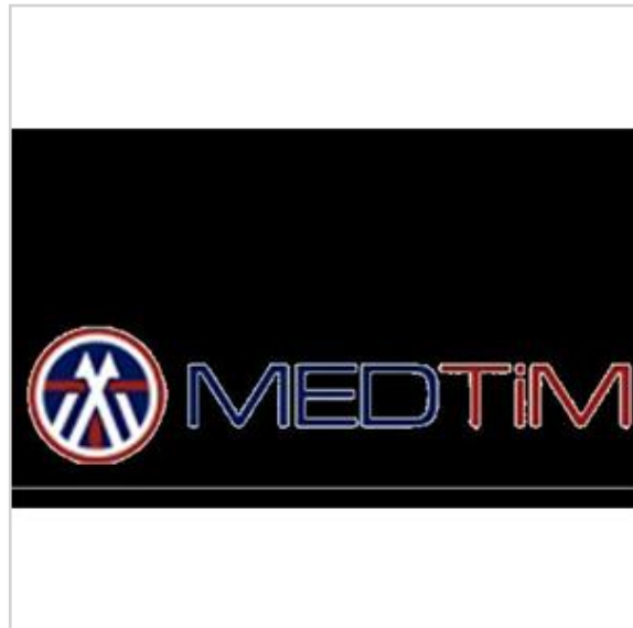
2.0 mm Cortical Screw