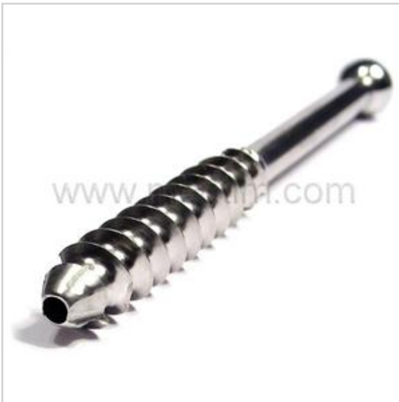
32 mm Thread 7.0 mm Cannulated Screw