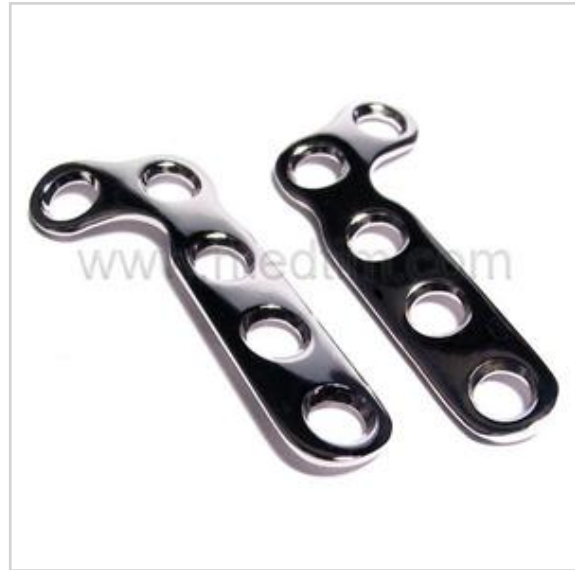
2.7 mm L-Shaped Plate - Oblique Angle