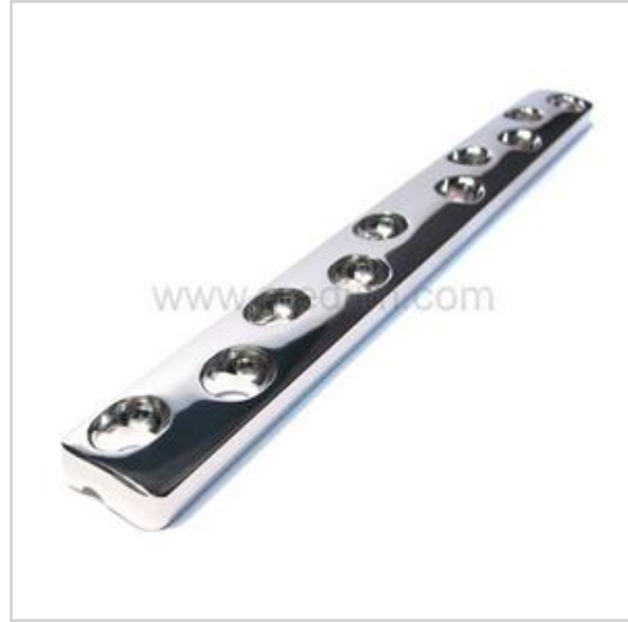
6.5 mm Broad Reinforced Dynamic-Compression Plate