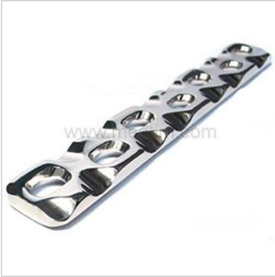
4.5 mm Broad Limited-Contact Dynamic-Compression Plate (LCDCP)