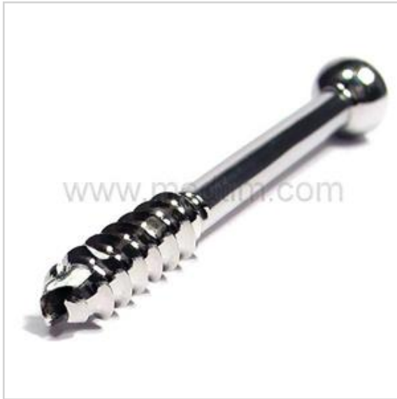
Partially Threaded 4.5 mm Cannulated Screw