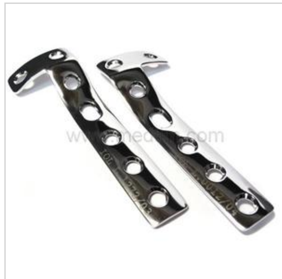
4.5 mm L-Shaped Locking Compression Plate