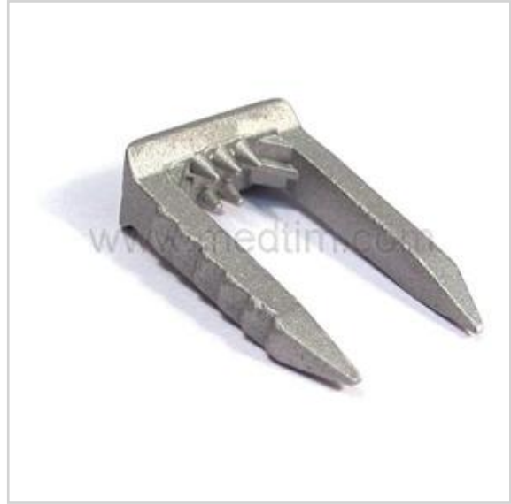
Blount Staple for Ligaments