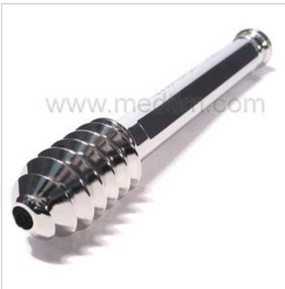
Sliding Screw for Dynamic Hip / Condylar Screw (DHS / DCS) Plates