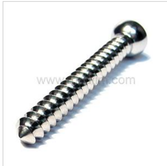
4.5 mm Cortical Screw