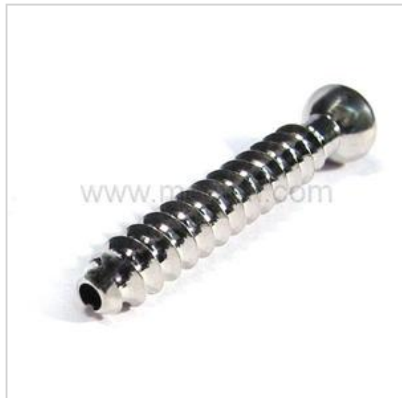
Fully Threaded 4.5 mm Titanium Cannulated Screw