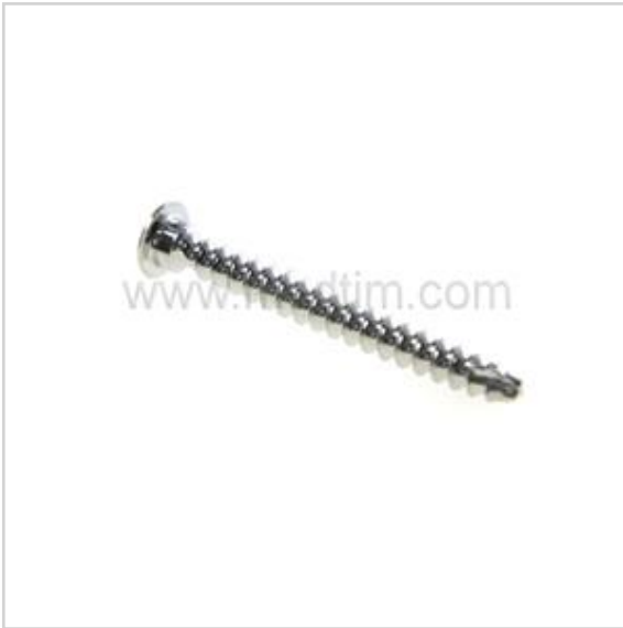
Fully Threaded 2.4 mm Volar Plate Screw