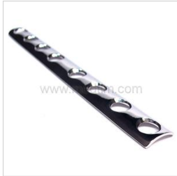
3.5 mm One-Third Tubular Plate