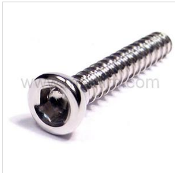
2.7 mm Cortical Screw