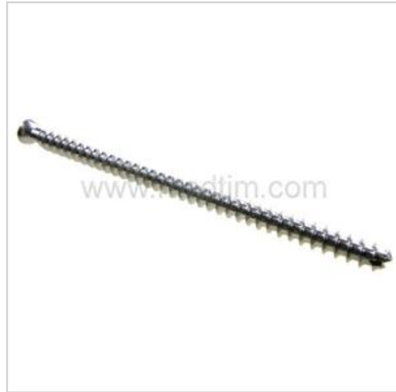
Fully Threaded 7.0 mm Titanium Cannulated Screw