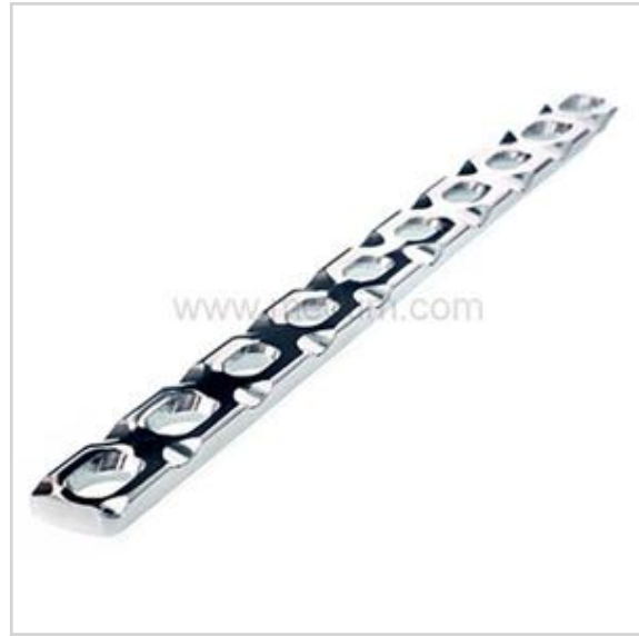
4.5 mm Narrow Limited-Contact Dynamic-Compression Plate (LCDCP)