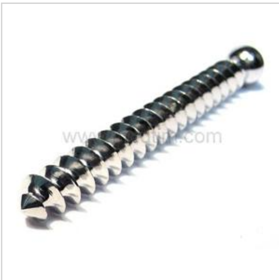
Fully Threaded 6.5 mm Cancellous Screw