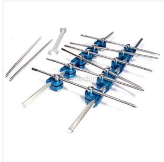
Linefix External Fixator