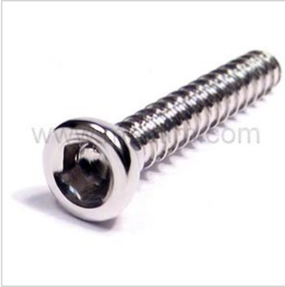
2.7 mm Cortical Screw