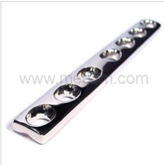
3.5 mm Small-Fragment Dynamic-Compression Plate (DCP)