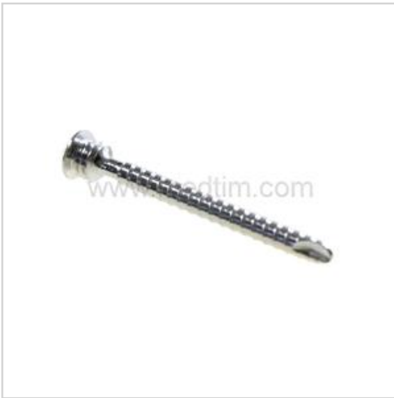
2.0 mm Volar Plate Screw