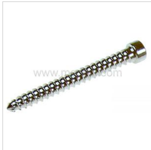
Proximal Femoral Nail Screw