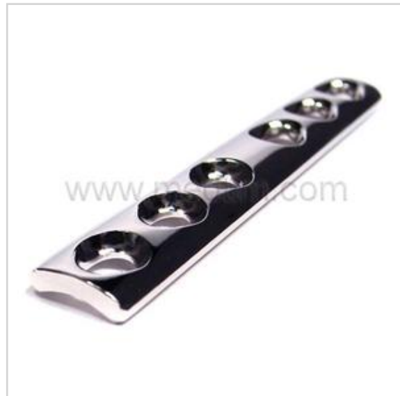
2.7 mm Straight Dynamic-Compression Plate (DCP)