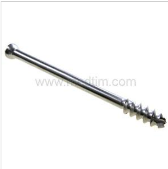
16 mm Thread 7.0 mm Titanium Cannulated Screw