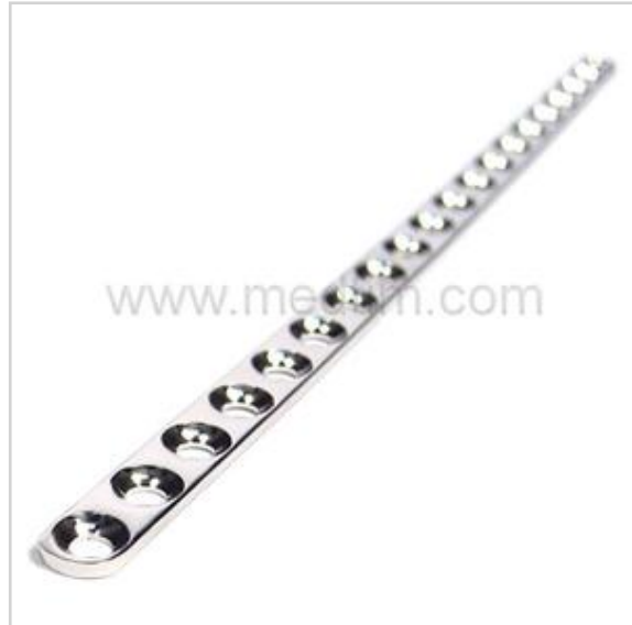
1.5 mm Miniplate