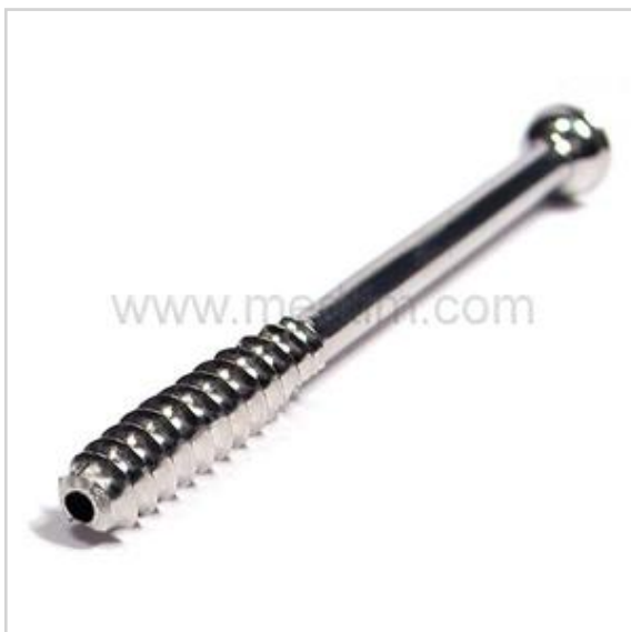
Partially Threaded 3.5 mm Cannulated Screw