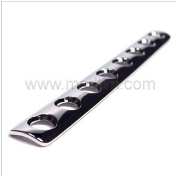
2.7 mm Quarter Tubular Plate