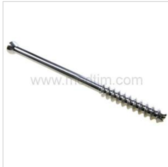
32 mm Thread 7.0 mm Titanium Cannulated Screw