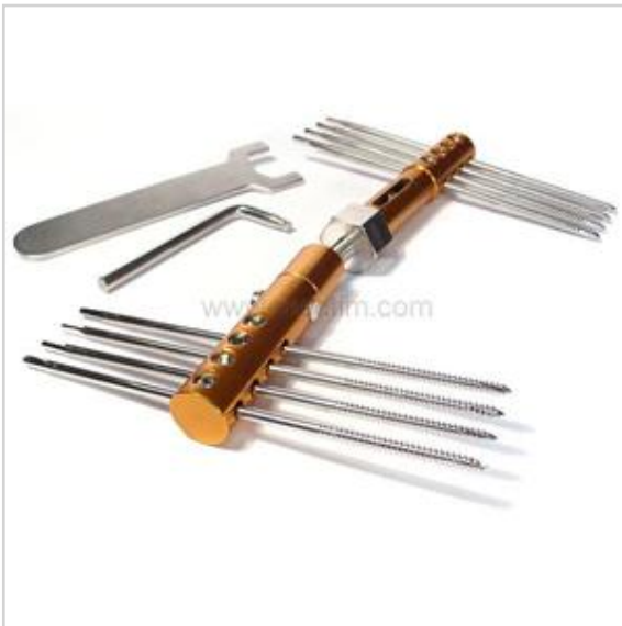
External Fixator for Humerus Fractures