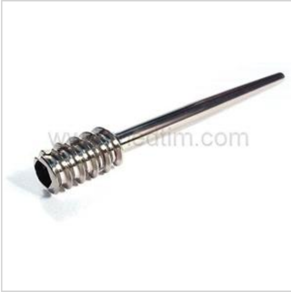
Transverse Interference Screw