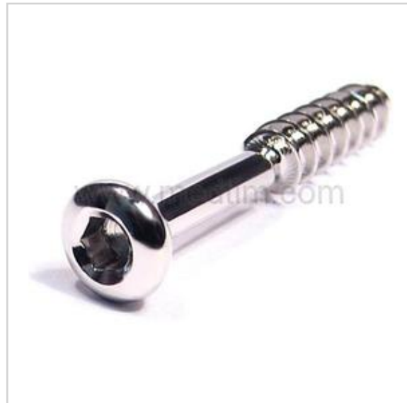
Partially Threaded 3.5 mm Cancellous Screw