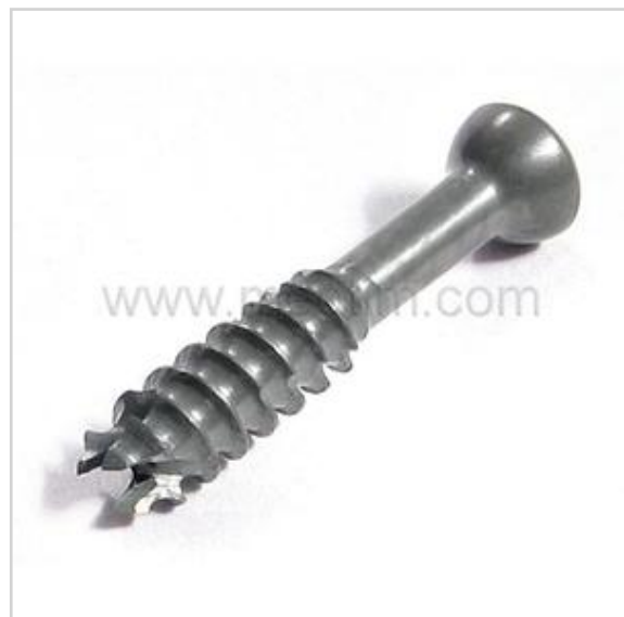
Partially Threaded 3.5 Titanium Cannulated Screw