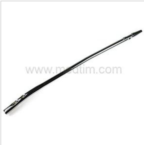
Tibial Intramedullary Nail