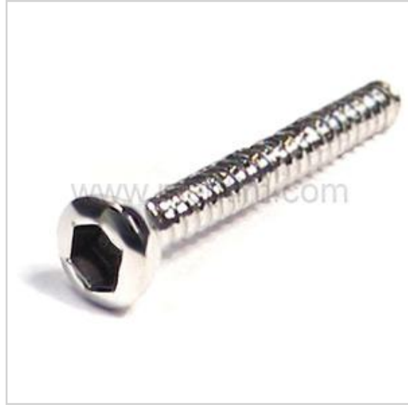
2.0 mm Cortical Screw