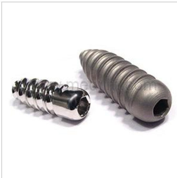
Partially Threaded Interference Screw