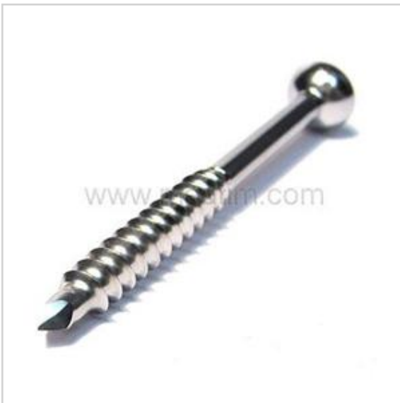
4.5 mm Malleolar Screw