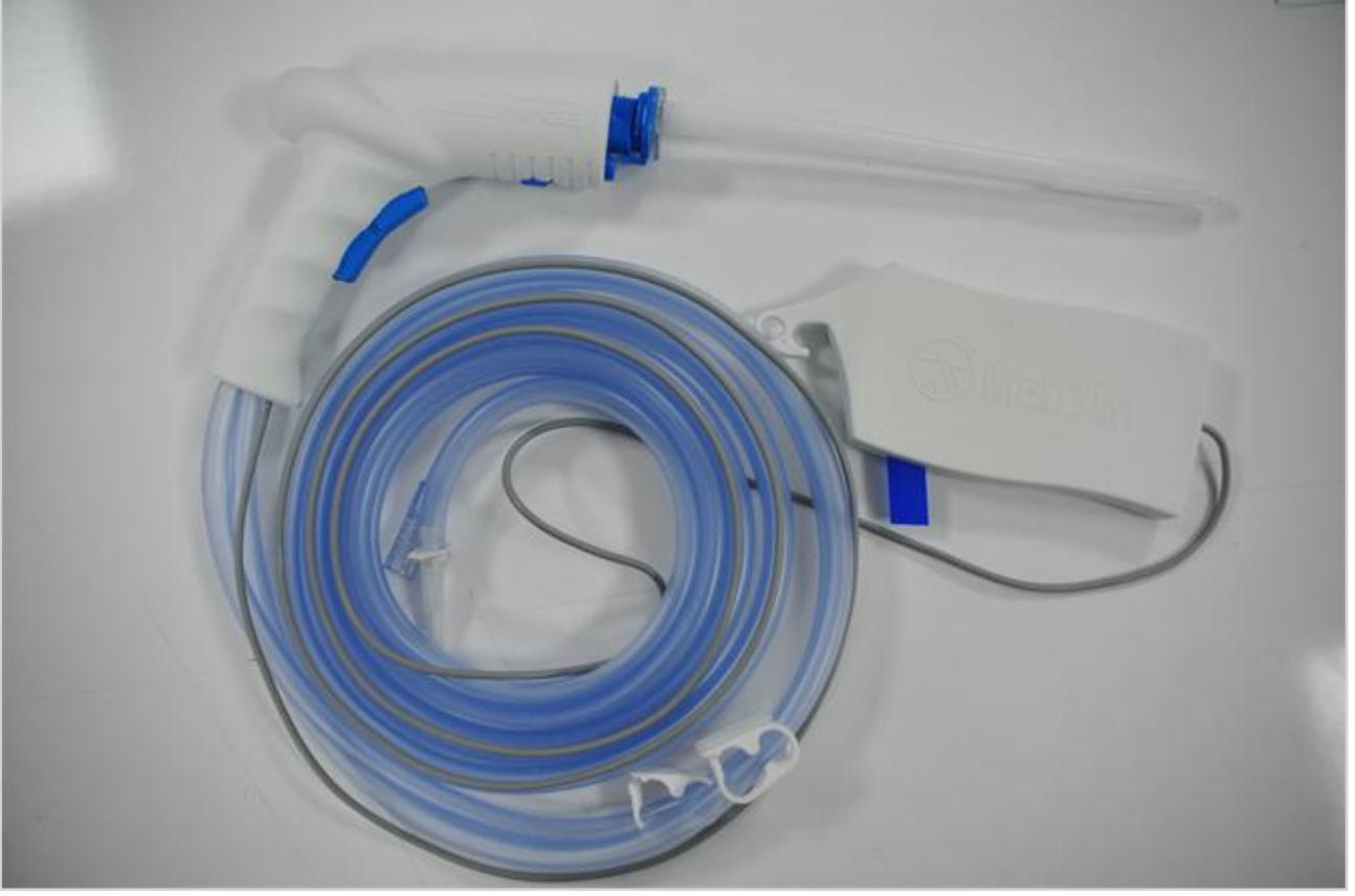
Basınlı Yara Yıkama Cihazı