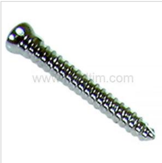
Distal Femoral Screw