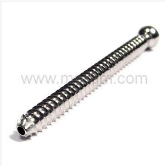
Fully Threaded 3.5 mm Cannulated Screw