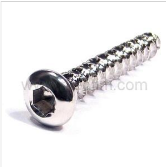
3.5 mm Cortical Screw with 1.75 mm Pitch