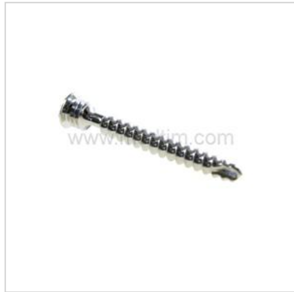
2.7 mm Volar Plate Screw