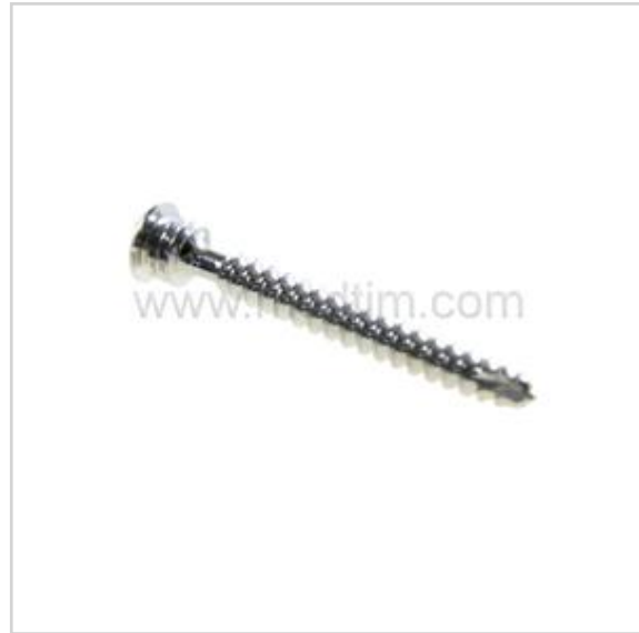
Partially Threaded 2.4 mm Volar Plate Screw