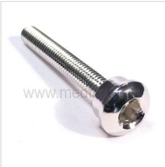
Compression Screw for Dynamic Hip / Condylar Screw (DHS / DCS) Plates