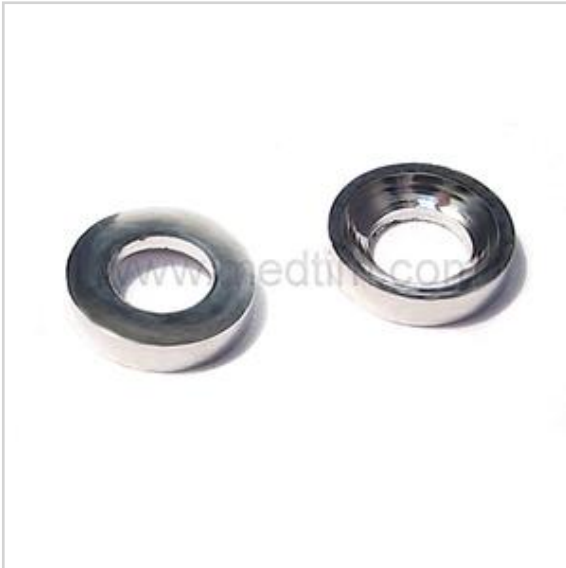
2.7 mm Washer